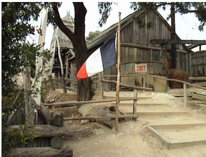
The French Flag at Sovereign Hill